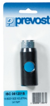
SKIN PACK (OBSOLETE)

Please take a moment to share this information with those in your organization whom this may affect. As always, we value your feedback and if you have questions regarding these changes, direct them to your Regional Sales Manager.